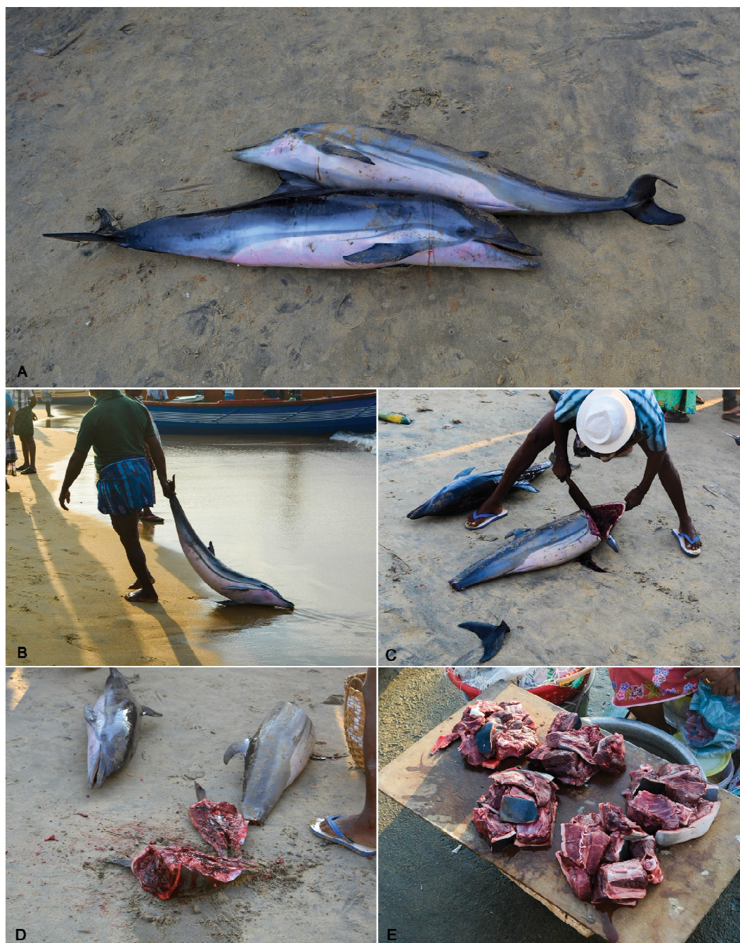
Fig. 4. Processing of striped dolphins ( Stenella coeruleoalba ) in the local market at Vizhinjam, Kerala coast, India