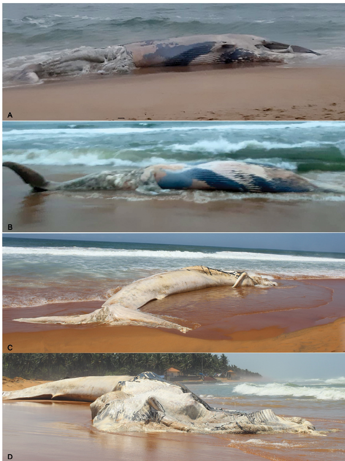
Fig. 1. Stranding of cetaceans in Thiruvananthapuram district, Kerala: A, B. Balaenoptera edeni ; C, D. Balaenoptera musculus

Pacific finless porpoise during 2017-2019 period. The sale of two striped dolphins ( Stenella coeruleoalba ) caught by the local fishermen in the local market at Vizhinjam fishing harbour was photo documented (Fig. 4 A-E) on 03.03.2017. The observations and interaction with NGOs and fishermen revealed that the demand for dolphin meat is common in the local fish market and the individuals caught were immediately processed by cutting off their head, flippers and fluke to avoid visual identification (Fig. 4 A-E).