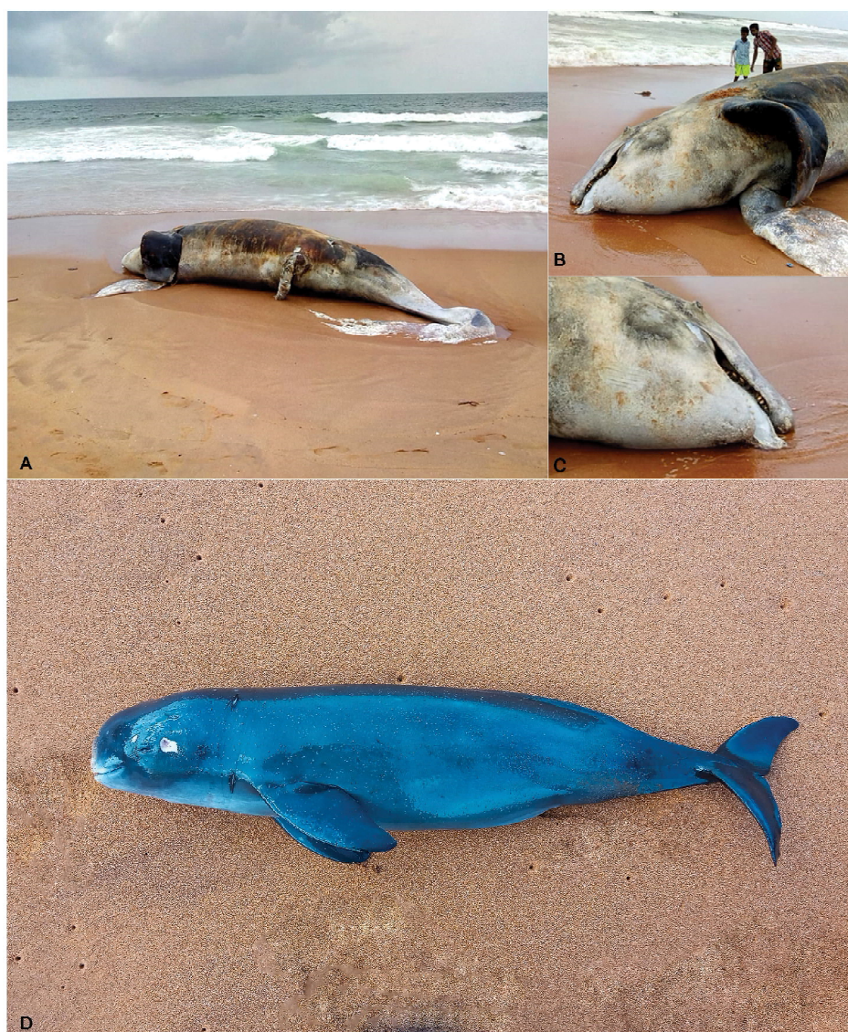
Fig. 2. Stranding of cetaceans in Thiruvananthapuram district, Kerala: A-C: Orcinus orca ; D: Neophocaena phocaenoides